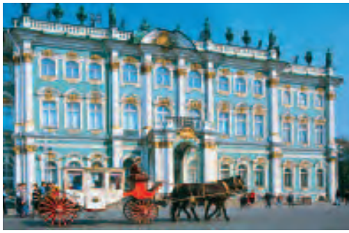
Tour the renowned State Hermitage Museum, once home to Catherine the Great, now the repository of Russia's greatest art collection.