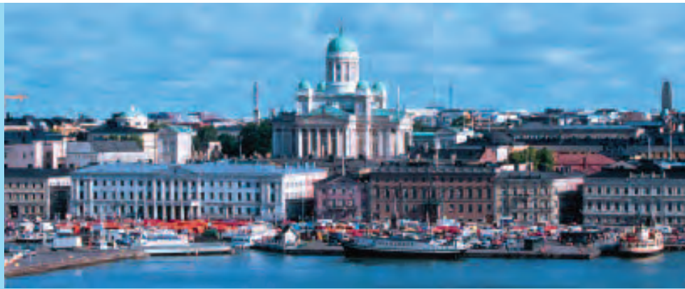
Admire the neoclassical and contemporary architecture of Helsinki, Finland, the “White City of the North.”