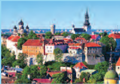
Stroll through Tallinn, a hub of European culture and commerce that retains its history in the 600-year-old spires and gables of its skyline.

the site of Emperor Alexander II's assassination, and the 19th-century St. Isaac's Cathedral, with a striking golden dome that is one of the glories of the city's skyline. Visit St. Petersburg's first building, the Peter and Paul Fortress, constructed to secure the country's access to the sea. See the impressive Baroque Cathedral of Sts. Peter and Paul, containing the tombs of 32 czars, from Peter the Great to Nicholas II, the last of the Romanovs.