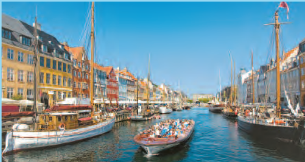
The Vikings' legacy and the maritime character of a traditional Hanseatic city are showcased along Copenhagen's Nyhavn Waterfront.

The afternoon is at leisure. Alternatively, join the optional excursion to the imperial compound of Pushkin and Catherine the Great's elaborate rococo palace, highlighted by a special visit to the extraordinary Amber Room.