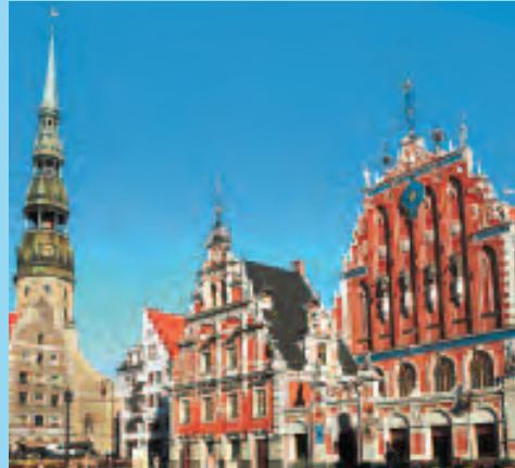
To commemorate Riga’s 800th anniversary in 2001, the town’s citizens donated bricks to rebuild the magnificent 14th-century Blackheads House.