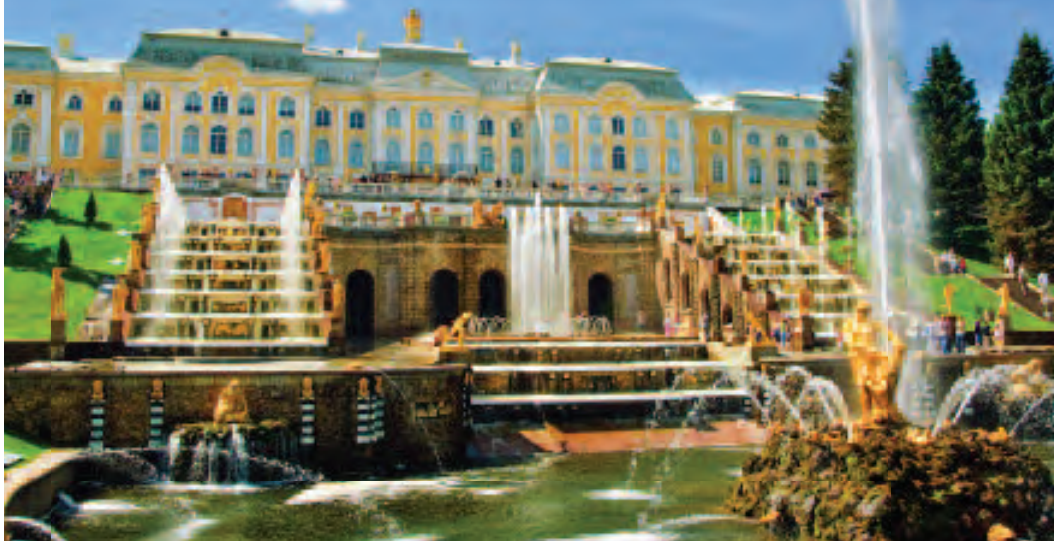
Photo this page: The focal point of Petrodvorets, Peter the Great's summer palace, is the magnificent Grand Cascade, the waters of which start at the Great Palace and flow down to the Gulf of Finland.

Cover photo: In Stockholm's most historic district, the Gamla Stan, stately 17th-century palaces and cathedrals are interspersed with narrow alleys and pedestrian walkways lined with charming bookstores, antique shops, cafés and restaurants.