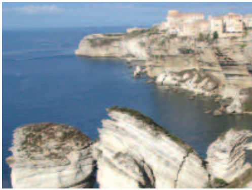
See Bonifacio's well-preserved medieval houses atop Corsica's stunning sun-bleached limestone cliffs.