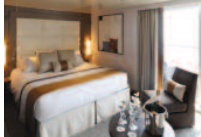
Stateroom with balcony

Ninety-five percent of the large, deluxe, air-conditioned, outside Staterooms and Suites (from 200 to 484 square feet) feature private balconies. Most accommodations have two twin beds that convert to one queen-size bed; each has a private bathroom with shower and the luxurious amenities of a fine hotel including: individual climate control, satellite flatscreen television, wireless Internet access, safe, minibar, full-length closet, writing desk/dressing table and plush robes.