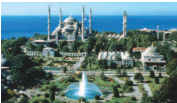
The Blue Mosque in Istanbul is one of the most splendid Ottoman monuments in the world.