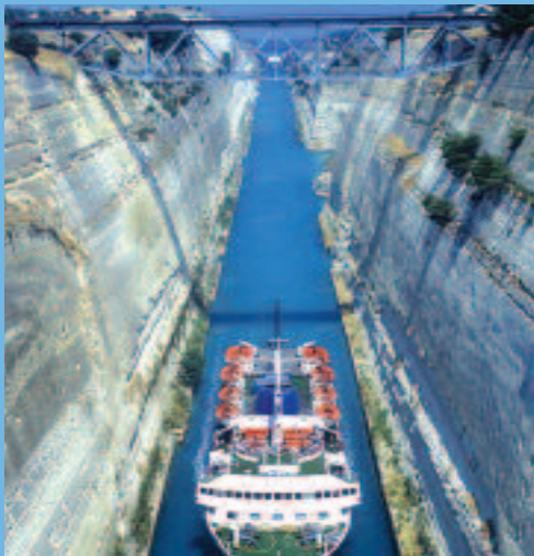
Admire the spectacular 300-foot sheer cliff walls of the Corinth Canal as you navigate this engineering marvel.

games became the ideal place for honing the mind and body for your personal glory as well as for your city-state and the god Zeus.