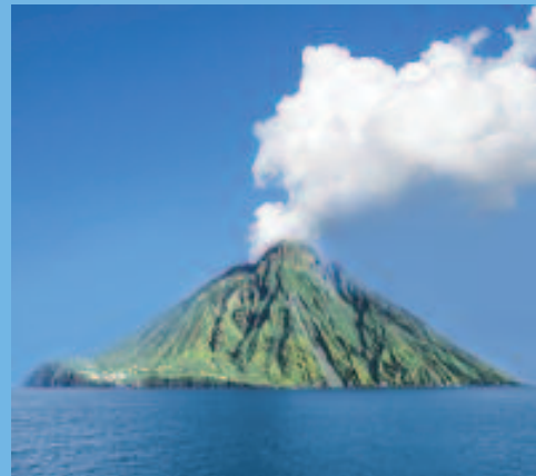
For ages, the island of Stromboli has served as a beacon by day and a lighthouse by night to sailors.

Alternatively, you could choose to explore the ancient Roman city of Pompeii, buried by the eruption of Mount Vesuvius in A.D. 79. Discovered and excavated 17 centuries later, Pompeii provides visitors with an intimate look at daily life during Roman times.