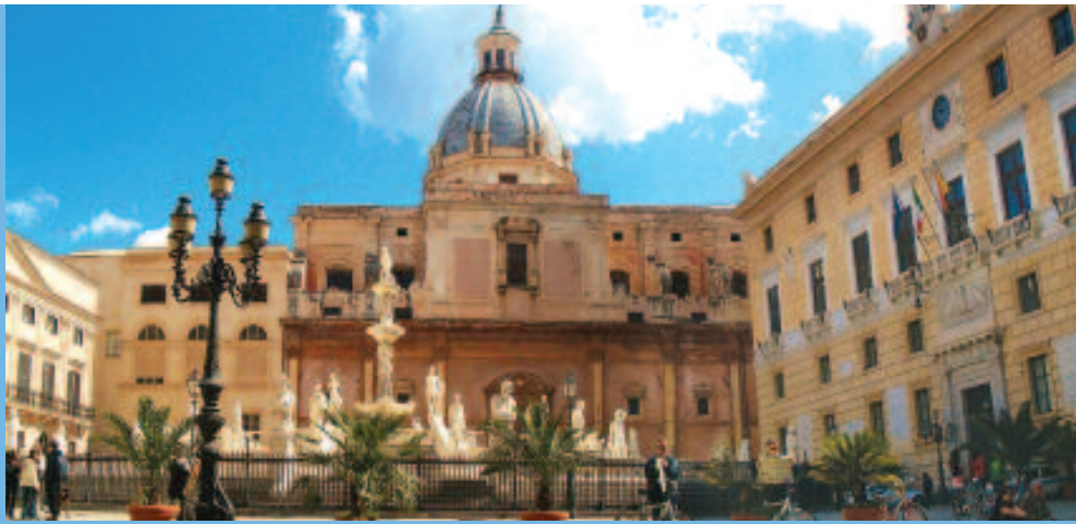
Around every corner in Palermo you will find spectacular piazzas, intricate fountains and elaborate limestone sculptures depicting the blending of ancient cultures that have infused the heart of the city.

that has touched the Mediterranean world, blending Christian, Byzantine, Roman, Arab-Norman and Italian elements into a unique heritage encompassing all of Sicily's rich past. See the extraordinary golden mosaics that adorn the Palatine Chapel, and see the Norman Royal Palace, a perfect illustration of the Norman combination of Latin, Byzantine and Arab cultures. Continue on to see the Palermo Cathedral, built 1184. Also, visit the beautiful sixth-century Church of St. John of the Hermits, known for its bulbous red domes and elaborate architectural design.