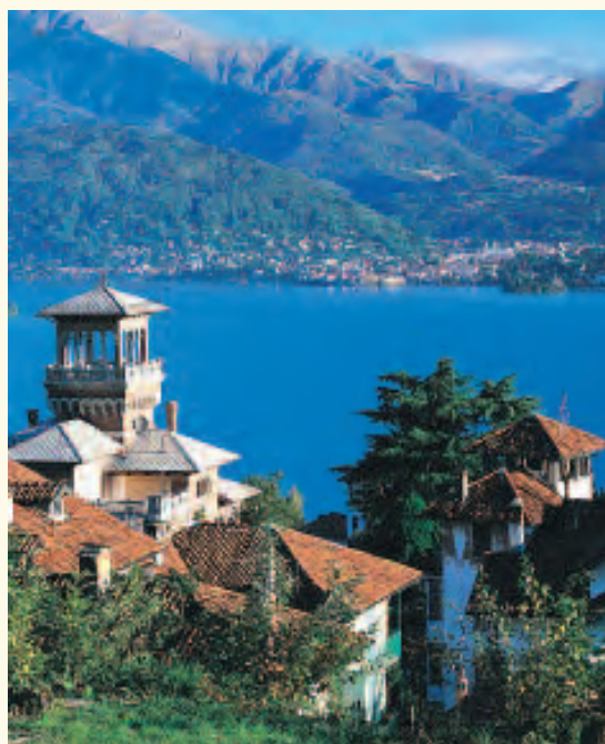
The beautiful town of Stresa on Lake Maggiore has beckoned European aristocracy for centuries.

From the deep-blue glacial lakes of Maggiore and Como to the bewitching Villa del Balbianello, from the medieval cobblestoned streets of Varenna to the modern sophistication of Milan, discover the exquisite gem that is the Italian Lake District.