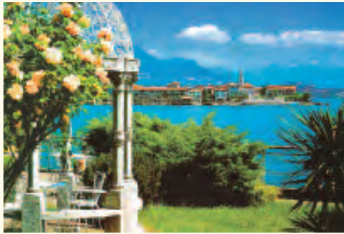
Picturesque lakes, Alpine views and grand villas define the beauty and charm of Lake Maggiore.