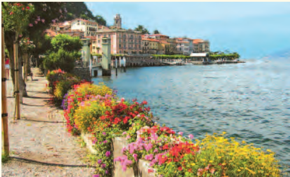
Visit picturesque Bellagio, a splendid combination of fin-de-siècle architecture and stunning panoramic views of Lake Como and the majestic Alps. Inset above: Statue at Villa del Balbianello.