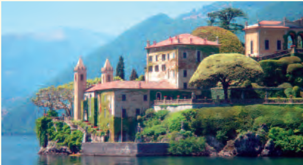
Nestled on the shores of Lake Como and surrounded by majestic Alpine peaks, the legendary Villa del Balbianello has one of the most beautiful and dramatic settings in all of Italy.