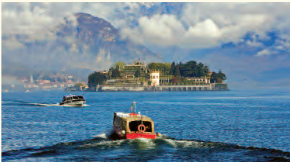
Isola Bella is the most spectacular of the three Borromean Islands, located on the Italian side of Lake Maggiore. Visit the magnificent 16th-century villa and stroll through one of the most beautiful gardens in the world.

Founded by the Romans in 196 B.C., Como’s cobblestoned passages wind past medieval towers and walls, Renaissance palaces and churches, Neoclassical 19th-century villas, and