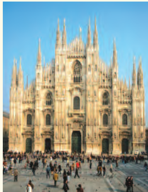
Visit Milan’s towering Duomo on the Pre-Program option, home to some of Italy’s finest religious art.

Italy’s second-largest lake and the natural boundary between the regions of Lombardy and Piedmont, Lake Maggiore rivals Lake Como as the most remarkable in the Lake District. The lake’s mild climate allows for the gardens to grow rare and exotic plants in the beautiful pleasure grounds beneath the high Alps. The deep, clear waters, have been a draw for many famous figures, including Flaubert, Wagner and Goethe.