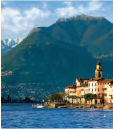
Surrounded by mountains and a splendid lake, the town of Lugano is full of parks and flowers, medieval monuments and luxurious 19th-century villas.

small family-owned shops to the Piazza Cavour and the tranquil lakeside promenade. The Piazza del Duomo, considered to be the most beautiful cathedral in Lombardy, took nearly 400 years to complete and reflects a seamless blend of Gothic and Renaissance styles.