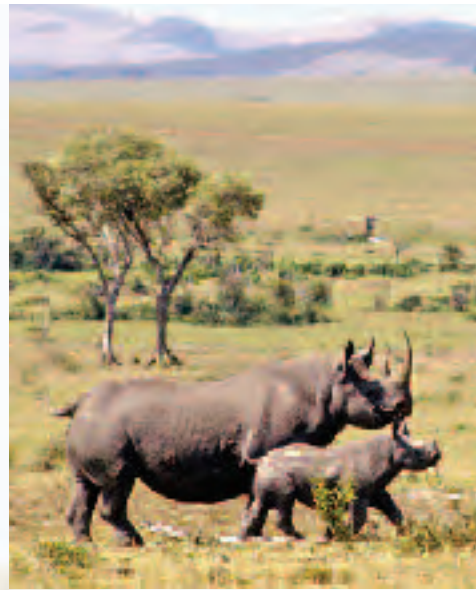
The Serena Lodge offers spectacular views, like this one of a black rhinoceros and its offspring.