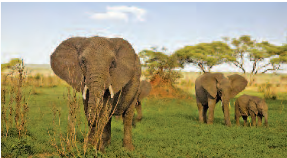
Across the plains of the Serengeti, families of elephant migrate to the lush grasslands in search of water, food and a place to rest.

famous inhabitant, the lion, who likes to climb and languidly lie draped over the branches of the acacia tree.