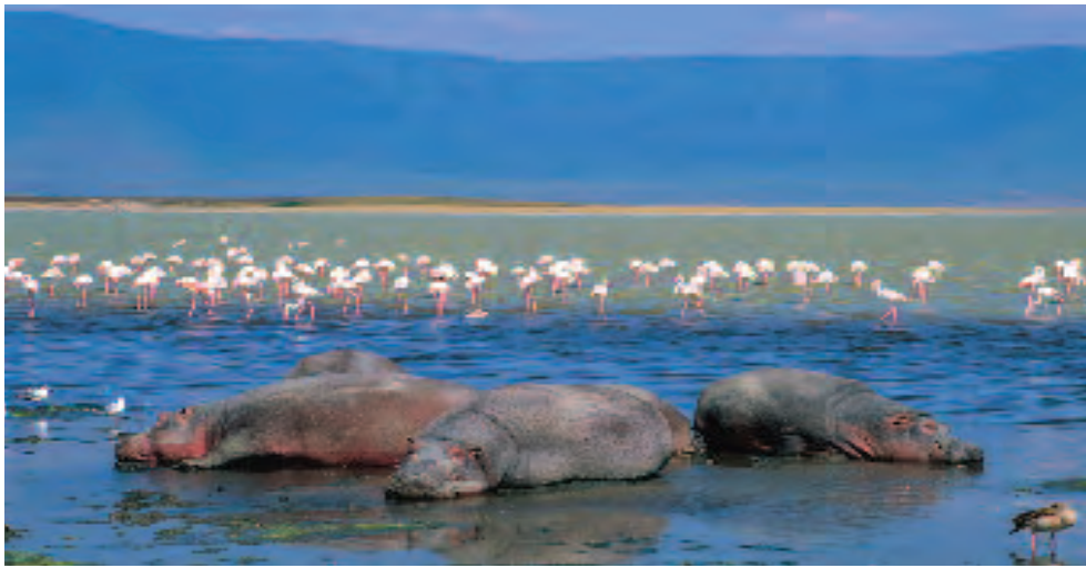
Ngorongoro Crater's wetlands offer a cool sanctuary for a pod of hippopotamuses, which can run as fast as 30 miles per hour and may weigh more than 4,000 pounds.