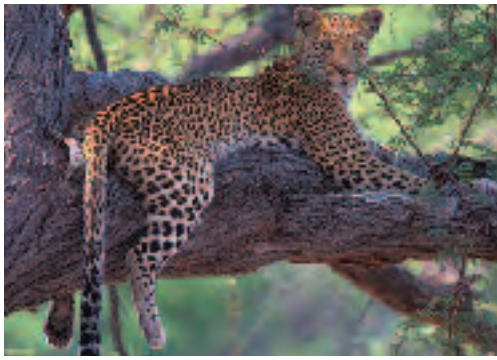
Watch for the elusive leopard, a master of concealment, relaxing on large tree branches.

PRSRT STD U.S. Postage PAID Gohagan & Company