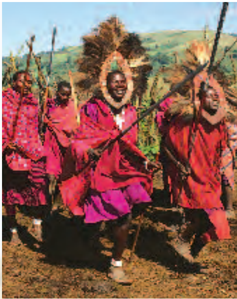
Masai proudly perform the ritual of their forefathers in traditional attire.

of grazing animals, who in turn attract lion, leopard and cheetah.