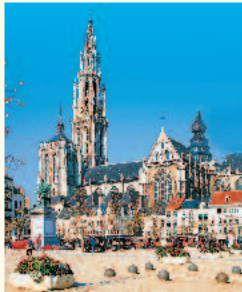
Antwerp's 16th-century Cathedral of Our Lady was inscribed on the UNESCO World Heritage list of Belfries of Belgium and France in 1999.

Since the 17th century, flowers have been a major Dutch industry. Visit the Aalsmeer Daily Flower Auction, the world's largest, where the international market prices for flowers and plants are determined each day. Almost 19 million flowers are sold to distributors each day in the world's third largest building (10.6 million square feet).