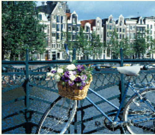
Historical Amsterdam is a city of canals and charming 16th- and 17th-century merchants' houses.