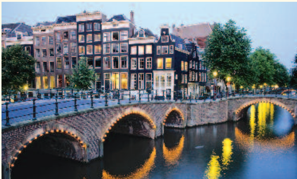
Amsterdam's charming bridges and picturesque canals bring the intimacy of a small town to one of Europe's most celebrated cities.

Eighteenth-century row houses, sleepy canals and a picturesque waterfront evoke the glory days of the Zuiderzee and typify the beauty and charm of the Dutch fishing port of Volendam, where many residents still don the traditional dress of the region. Built along the top of a dike, the village's primary