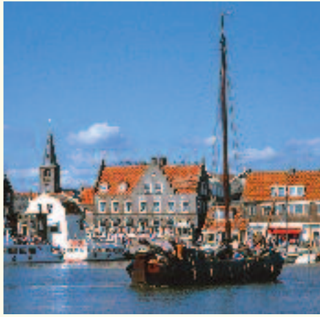
Step back in time in the charming port of Volendam, a traditional Dutch fishing village.

thoroughfare is lined with colorful cafés and purveyors of fresh fish, handmade cheeses and a myriad of traditional crafts.