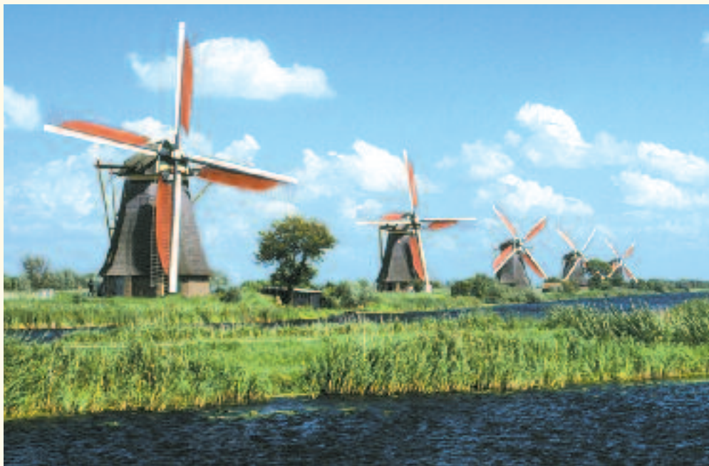
Tour authentic 18th-century windmills, the perfect examples of innovative Dutch engineering, at Kinderdijk. Inset above: Many residents of Volendam still wear the traditional costume of North Holland.