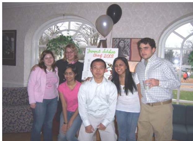
—Fremont Scholars 2008

friends. I remember that we said, "Well, you are all Bucknellians." Now, as they move on to share themselves in different places, I hope they remember that they will always be Bucknellians, part of our community and our hearts.