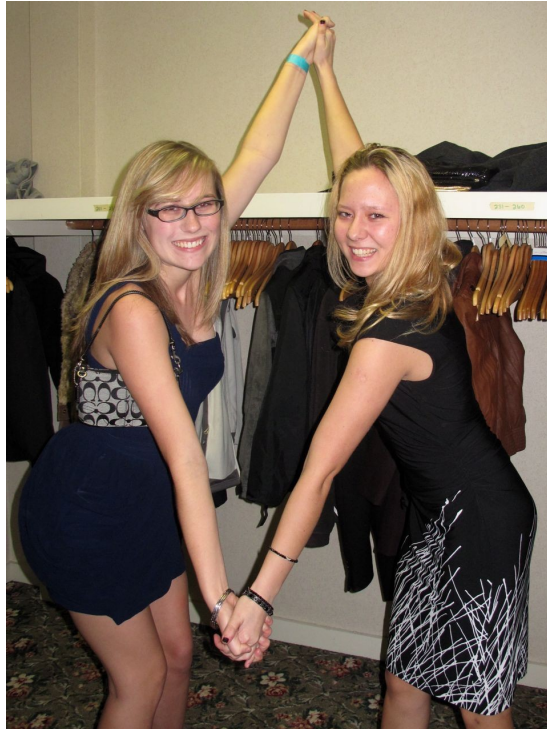
From Cultural Center Staff...

Please keep the Vedder Cultural Lounge in mind for a unique place to hold your weekly office staff meetings, club meetings, or just a quiet place to study.