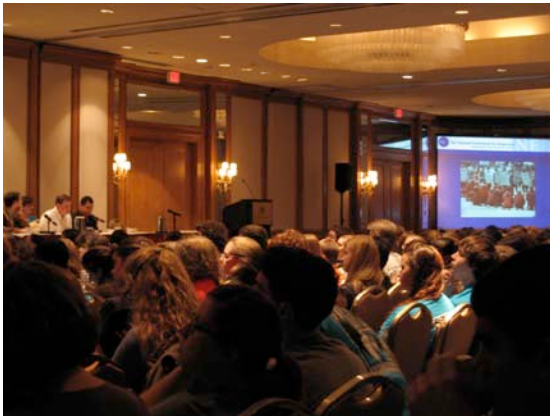
Students learn about the situation in Burma from representatives from the US Campaign for Burma.