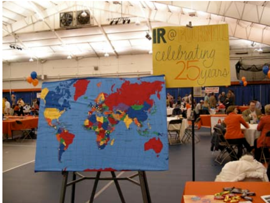
Homecoming Academic Village

With our students, alumni, faculty, and administrative colleagues present, the IR Department marked the 25 th anniversary of the start of a formal program in IR with three events that took place during Homecoming weekend.