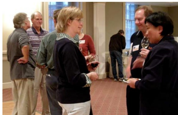
IR Reunion Reception