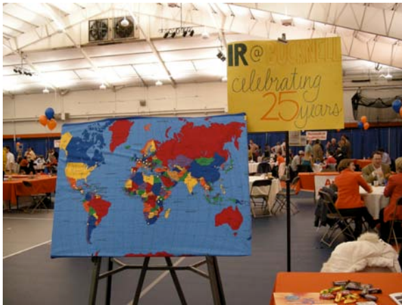
Homecoming Academic Village