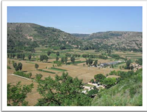
A rural village in Changwu County, Shaanxi Province.

In recent decades, the People's Republic of China has experienced rapid economic growth; however, this prosperity has not been evenly distributed and obvious disparities continue to exist between China's coastal provinces and the interior western region. In order to address these inequalities, the Chinese government implemented the Great Western Development Strategy in 2000 (Goodman 2004). This policy aimed to transition Western provinces from an agrarian economy to a manufacturing and service-based economy through the efficient use of the West's abundant raw materials and through heavy central government investments. Investment has taken the form of transportation infrastructure projects, government subsidies and technical support for farmers, and a number of other projects.