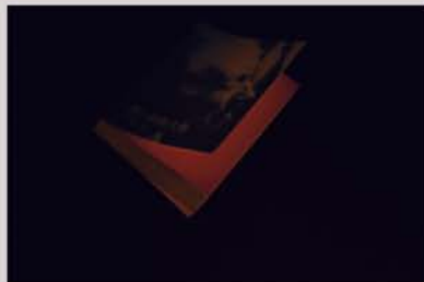
Untitled (Writings by Borges No. 1)