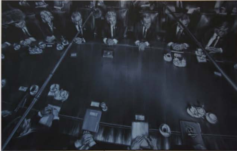
November 5, 2004. N.Y.T. (Bush Cabinet 2nd Term), 2008, oil on linen, 70" x 110 1/2"