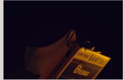
Untitled (Being and Nothingness)