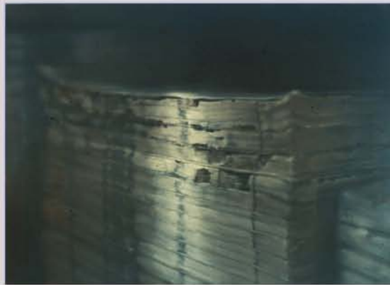
Chinese Library No. 1, 1995, oil on canvas, 30" x 42"