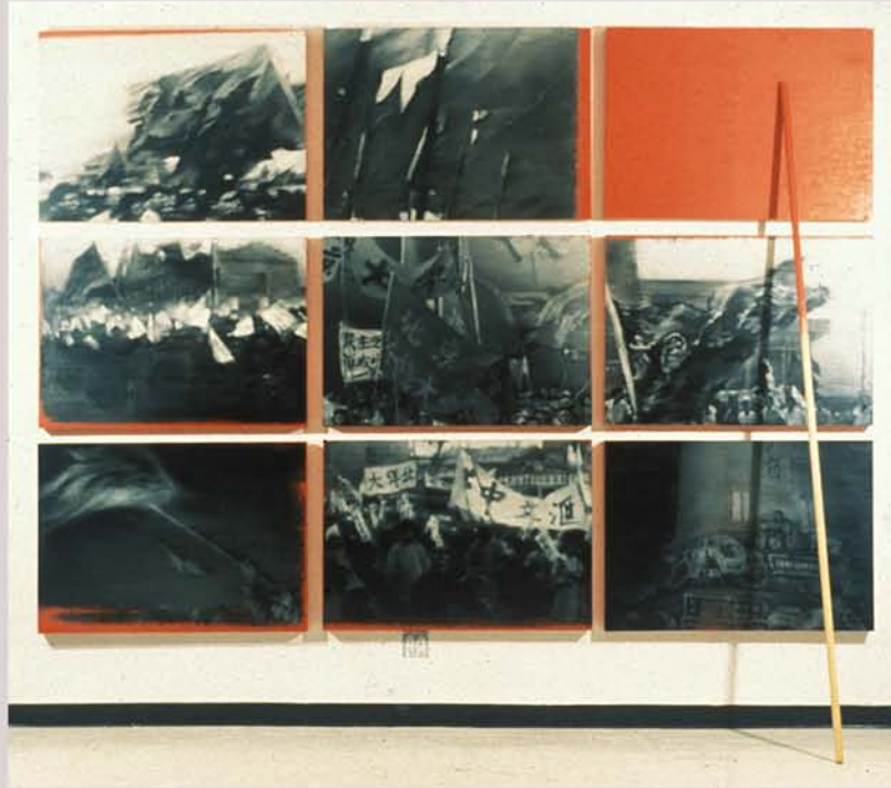
Flags & Banners: A Century of Student Movements in China, 1994 oil and acrylic on wood, 117" x 141" x 26"