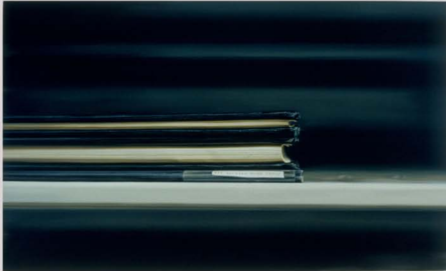
The MoMA Library (1390p) , 2005, oil on canvas, 54" x 90"