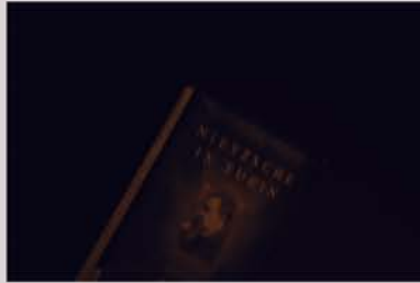
Untitled (Nietzsche in Turin) all 2006, digital print, 23 5/8" x 35 3/8" each