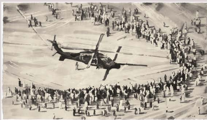
May 18, 2003. W. P. , 2006, ink on rice paper, 41 3/4" x 74"