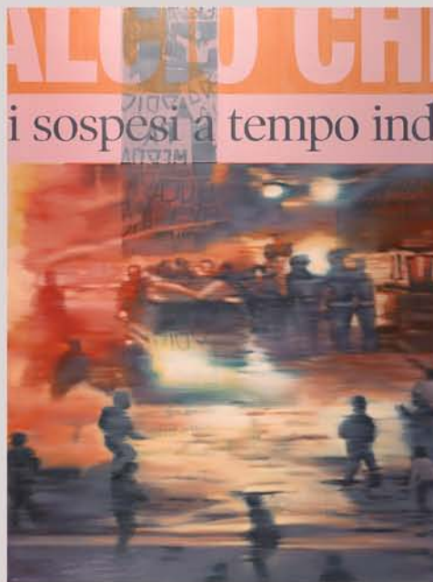
February 3, 2007, L.G.D.S. (No. 2), 2008, oil and acrylic on canvas, 80" x 60"