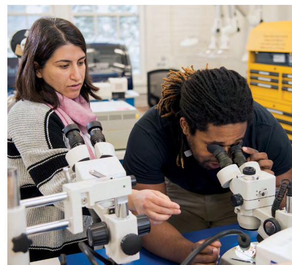
Data as of 07/03/18.