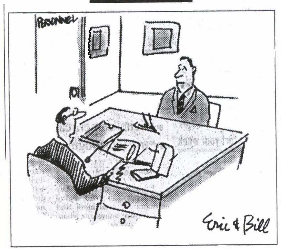
"No offense, but the job requires a problem solver – your resume indicates you're more of a problem maker."