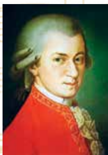
Wolfgang Amadeus Mozart

Since the 18 th century, the lands encompassing the Danube River Valley—Austria, Hungary and Germany—and the Czech Republic have bequeathed to the world an unparalleled musical legacy.