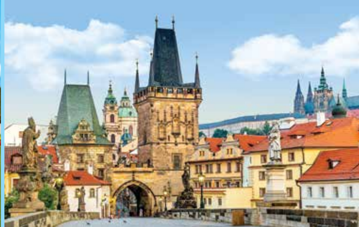
Admire the Charles Bridge and its Baroque statues, the lively streets of Prague's Old Town, or Stare Mesto, then watch the medieval Astronomical Clock.

Visit the Romanesque, 14 th -century Cathedral of St. Martin and the elaborate Primatial Palace; see St. Michael's Gate, Bratislava's oldest preserved medieval fortification, originally built in 1300. This evening, enjoy a delightful performance of classical music on board the ship.