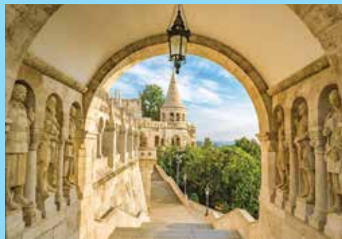
Enjoy your visit to the Fisherman's Bastion.

Visit the Romanesque, 14 th -century Cathedral of St. Martin and the elaborate Primatial Palace; see St. Michael's Gate, Bratislava's oldest preserved medieval fortification, originally built in 1300. This evening, enjoy a delightful performance of classical music on board the ship.