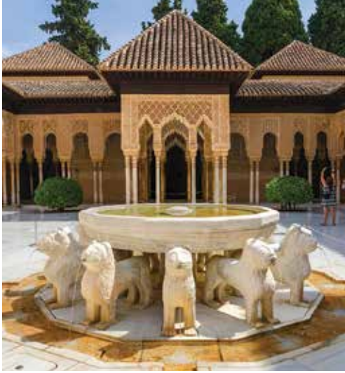
Tour the Court of the Lions, the main courtyard of the Nasrid dynasty Palace of the Lions, in the heart of the Alhambra.

PRSR STD U.S. Postage PAID Gohagan & Company