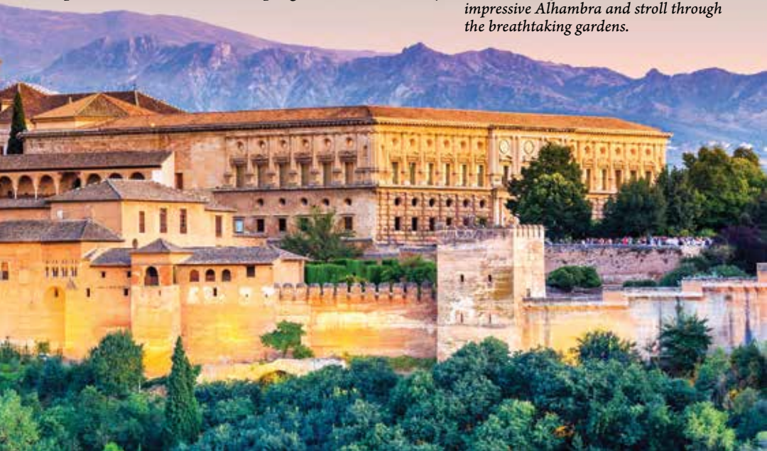
Photo this page: Explore Granada's impressive Alhambra and stroll through the breathtaking gardens.

Cover photo: Stroll over the colorful, storied bridges in Seville's Plaza de España.