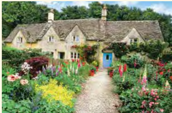
Stroll past the well-preserved homes and exquisite gardens of Bibury, known as “the most beautiful village in the Cotswolds.”

Bucknell University is pleased to offer information regarding this travel opportunity. Bucknell is not the trip provider, however, and is not responsible or liable for any aspect of the trip planning or delivery. Individuals with questions or concerns regarding the trip should contact the travel program vendor directly.