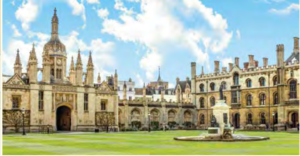
Admire the architecture of the main court of King's College, University of Cambridge.