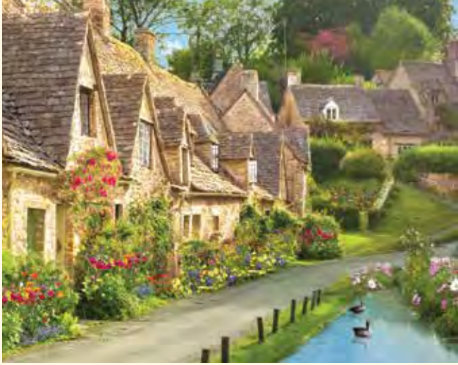
Delight in the old-world charm of the honey-colored weavers' cottages in Arlington Row, Bibury, nestled in the Cotswolds.

leather wall coverings, Italian embroideries, silk bed hangings and 400 years' worth of paintings and furniture, including a mahogany desk and chair that once belonged to Napoleon.