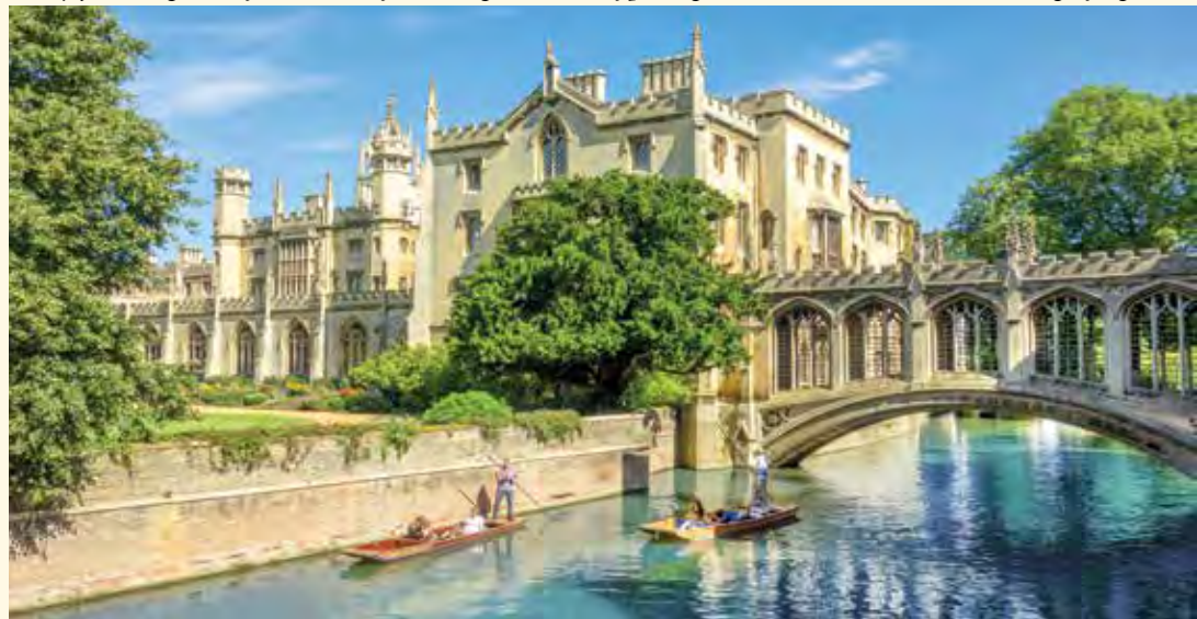
Enjoy stunning views of "the Backs" of Cambridge and scenes of punting on the River Cam and under the Bridge of Sighs.

Remarkable Highclere Castle, featured in the acclaimed PBS Masterpiece series Downton Abbey , is set in an Edwardian-period property among 1000 acres of sprawling parklands, expertly landscaped by "England's greatest gardener," Lancelot "Capability" Brown. The richly decorated state rooms have been restored with authentic elements including embossed Spanish