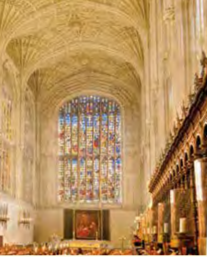
the world's largest fan vault ceiling within the nave of the choir of the Collegiate Church of St. Peter and St. Paul, Leicester, England.