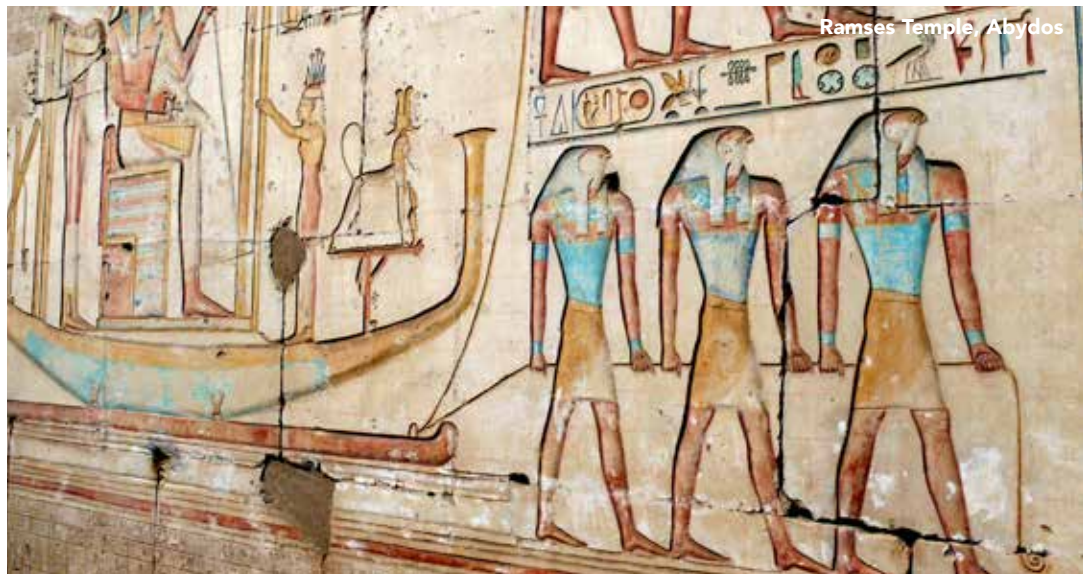
Ramses Temple, Abydos