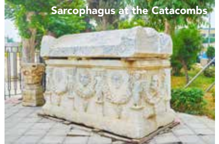
Sarcophagus at the Catacombs

After breakfast, return to Cairo to join guests on the main program