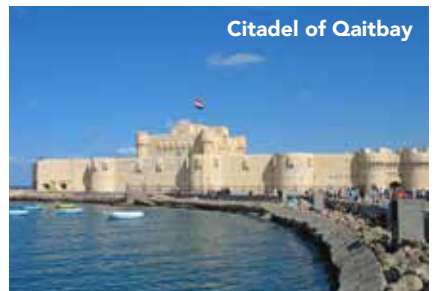
Citadel of Qaitbay