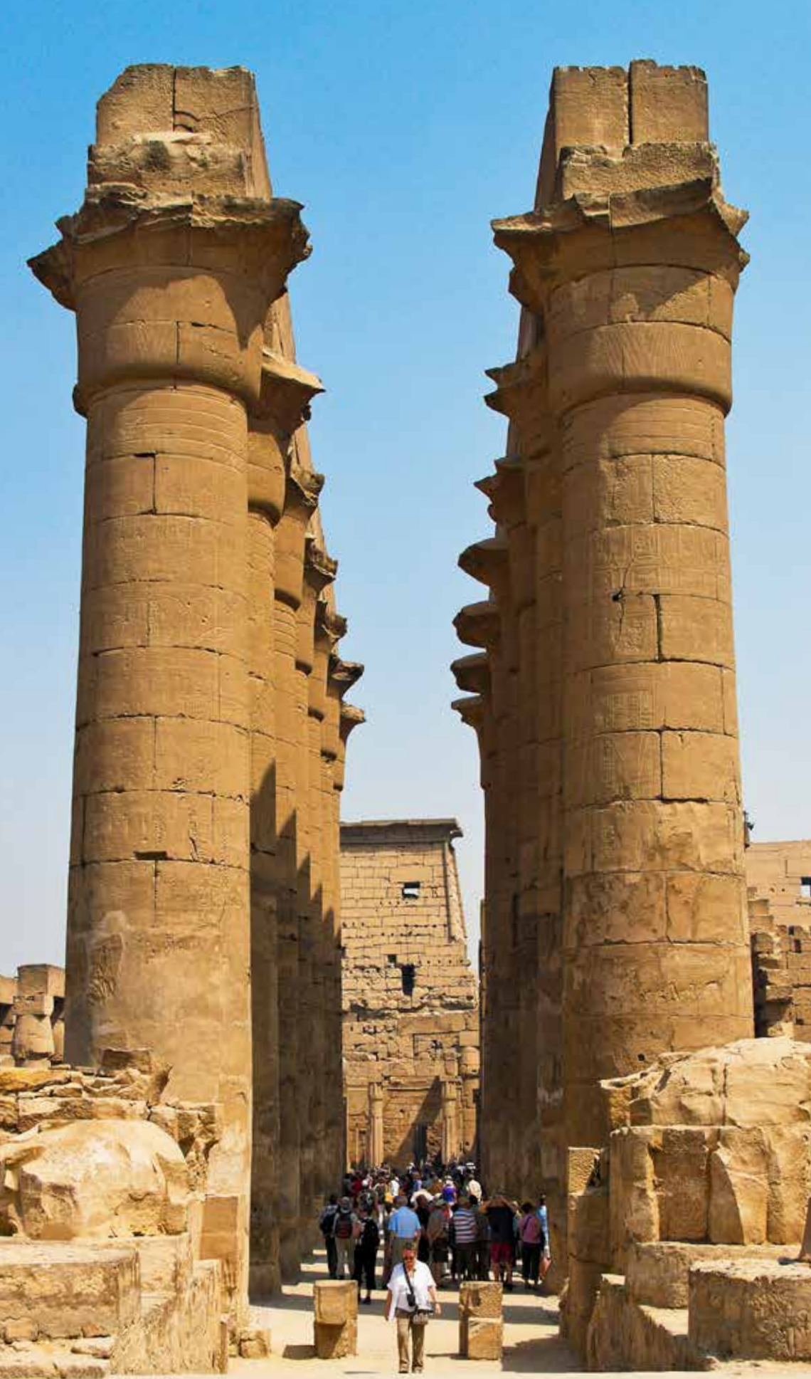
Temple of Luxor