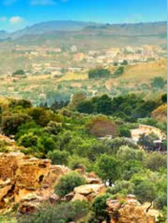
, built between 440 and 430 B.C., and the harmony of Classic Doric style.