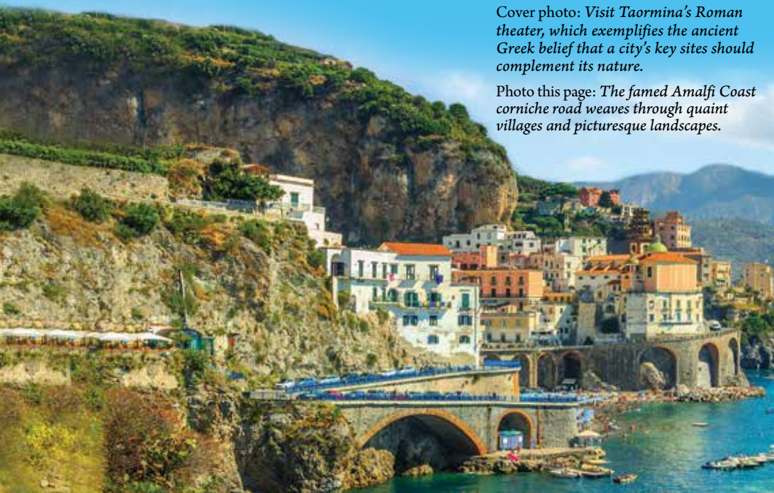
Photo this page: The famed Amalfi Coast corniche road weaves through quaint villages and picturesque landscapes.

Cover photo: Visit Taormina's Roman theater, which exemplifies the ancient Greek belief that a city's key sites should complement its nature.