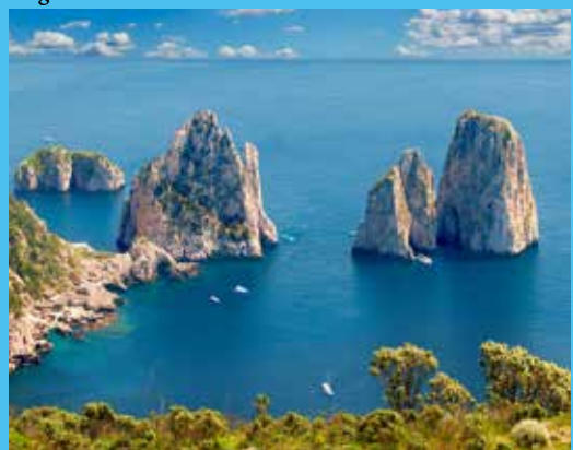
The Faraglioni are one of Capri's most dramatic sights; the three sea stacks can be seen from Augustus Gardens.

Disembark and continue on the Timeless Malta Post-Cruise Option or transfer to the airport for your return flight home.