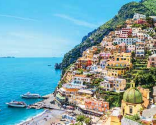
The beguiling coastal village of Positano forms part of the Amalfi Coast, a UNESCO World Heritage site.