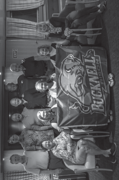
Bucknell alumni on Orbridge's The Galapagos Islands 2019 travel program.

Special Alumni Rate: Save more than $1,000 per couple