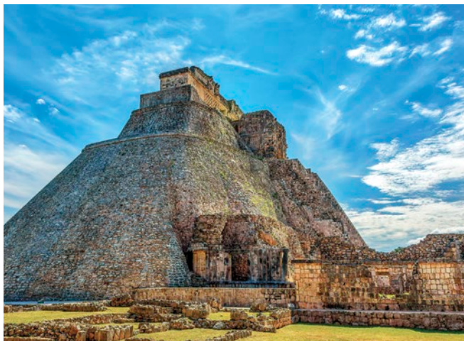
Pyramid of the Magician, Uxmal