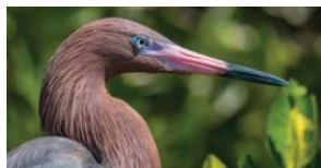
Reddish egret, Celestún