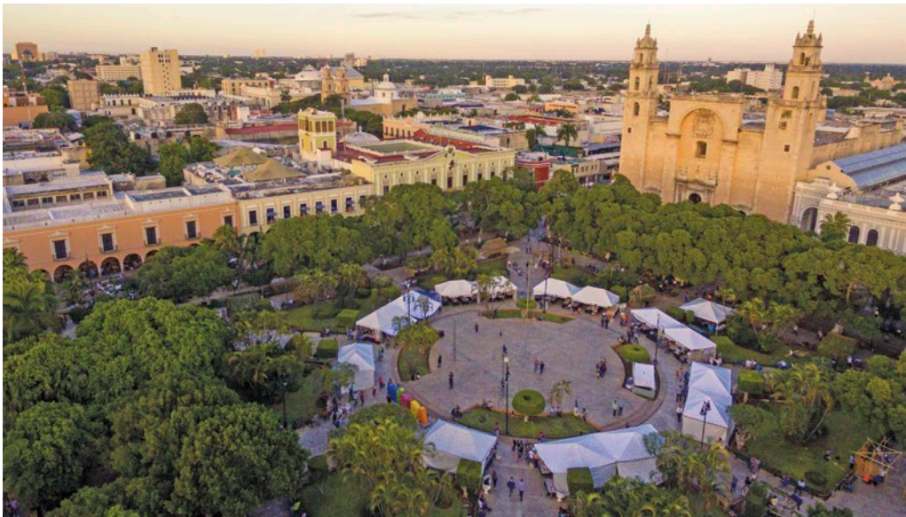
Cathedral and Plaza Grande, Mérida

Depart for Mérida, Mexico. 🌐 Arrive and transfer 🚗 to the Villa Mercedes Merida, Curio Collection by Hilton.