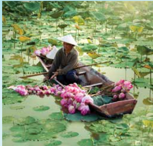
The lotus is one of Buddhism's most sacred flowers, blooming from muddy waters each morning.

Visit a local workshop which provides training for thousands of Cambodians to perpetuate the creation of their traditional, cultural handcrafts.