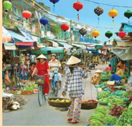
Experience Vietnam's kaleidoscopic markets, a vivid nexus of history, culture and commerce.