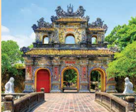
Pass through the Hien Nhon Gate, one of the fortified entrances into Hue's Imperial Citadel.

Nearby, the 11 th -century One Pillar Pagoda is one of Vietnam's most iconic temples, designed to resemble a lotus blossom (purity).