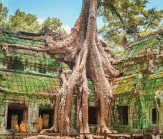
Roots cleave stones and lichen sprouts from delicately carved reliefs at the striking Angkor temple of Ta Prohm.

PRSR STD U.S. Postage PAID Gohagan & Company