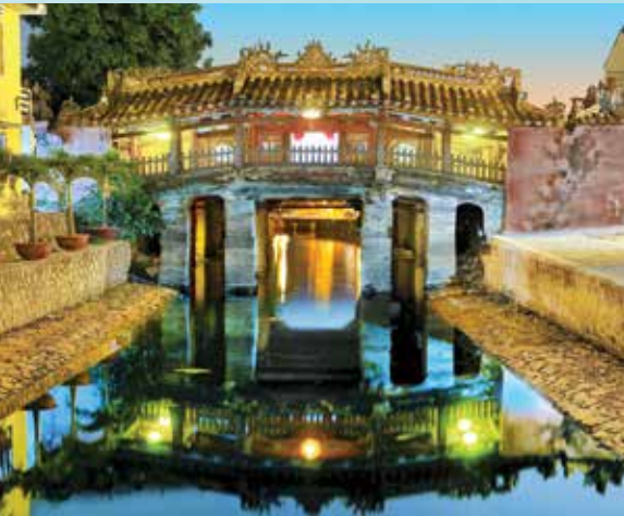
Admire the ornate, Lai Vien Kieu Bridge, built to link Hoi An's Chinese and Japanese quarters.

Near Siem Reap, the Temple of Angkor Wat is the largest religious structure in the world, built in the 12 th century by King Suryavarman II to honor the Hindu god Vishnu. Angkor Wat stands in testament to the centuries-long grandeur of the prosperous Khmer Empire.