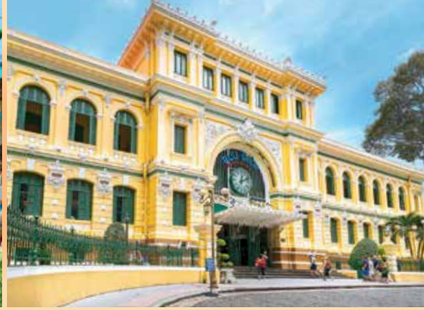
View Saigon's stunning, Neoclassical Central Post Office, built by Cochinchina's chief architect, Marie-Alfred Foulhoux, in 1891.

The astounding Banteay Srei Citadel of the Women is considered the ultimate expression of Khmer genius. Constructed in the 10 th century from rose-pink sandstone, the temple is believed to have been built by women based on the intricacy of the elaborate three-dimensional carvings and filigree relief work that adorn its peaked buildings.