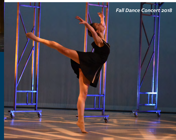
Fall Dance Concert 2018

In 1929 Berlin, a young American writer witnesses the end of bohemian life through frequent visits to the Kit Kat Klub. This hideaway, led by its bawdy Emcee, provides diversion and safe haven from imminent Nazi threat. Investigating questions of desire, power, and escape, this celebrated Kander and Ebb musical follows an unlikely cohort as they grapple with love and identity amidst the crumbling Weimar Republic. While the audience may know how the story will end, they will also act as witnesses, sharing in that bit of hope that the characters indulge in order to survive, escape, and live. Adult themes suggested age 13+