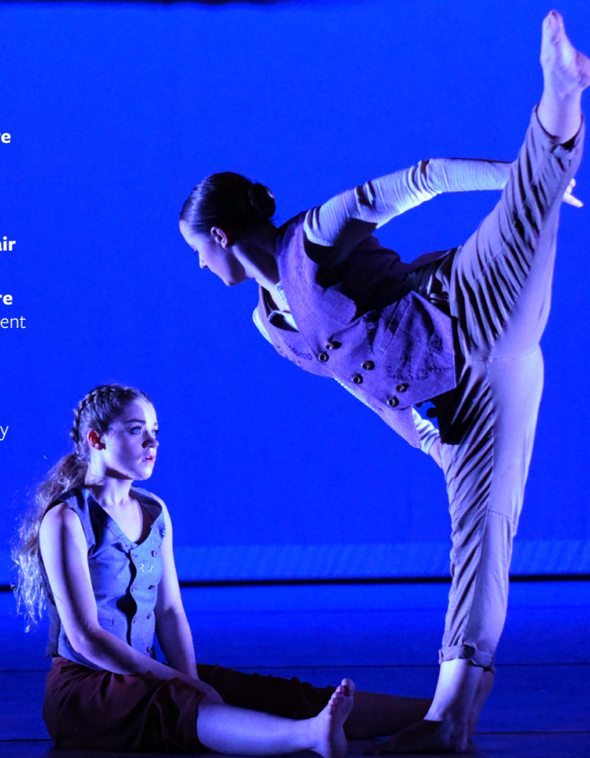
Fall Dance Concert 2018