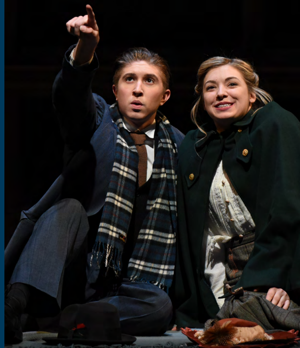
Fall Dance Concert 2018