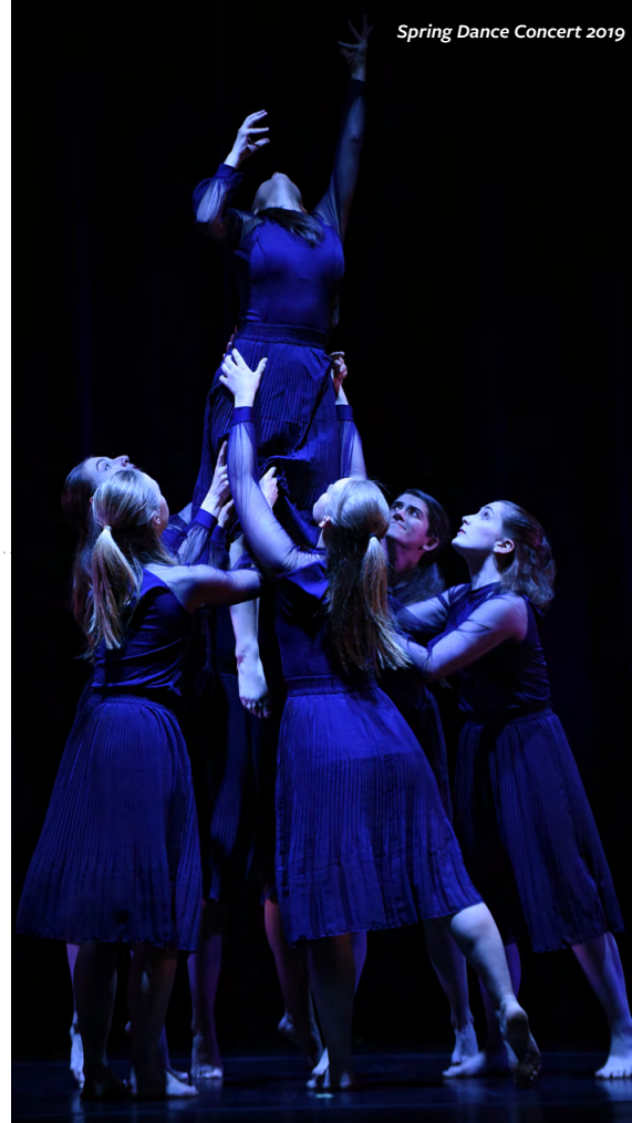
Spring Dance Concert 2019