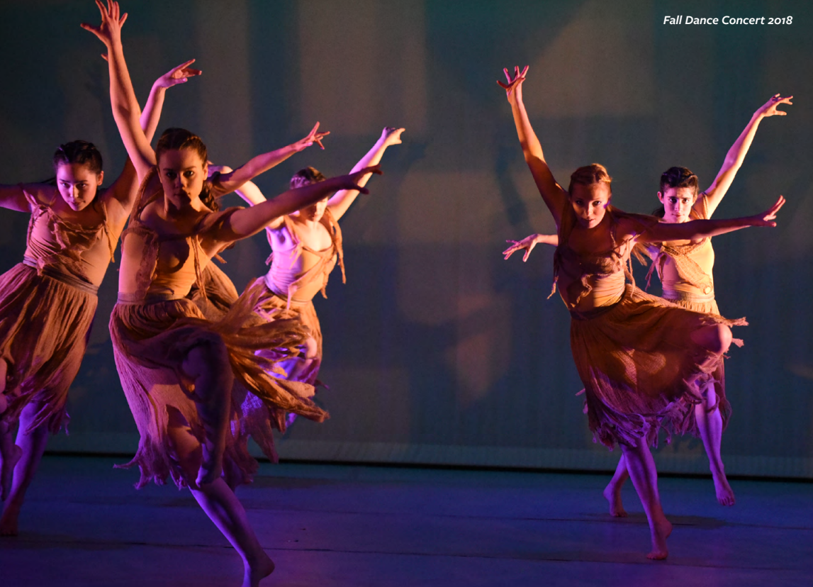
Fall Dance Concert 2018